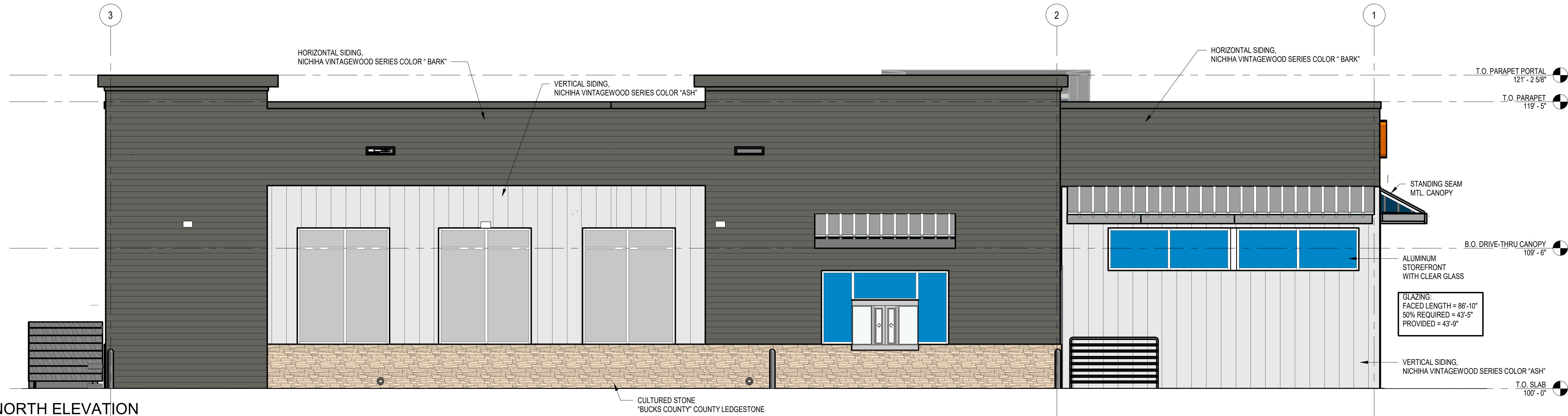
A4 NORTH ELEVATION SCALE 1/4" = 1'-0"

5/13/2025 8:24:31 AM C:\Users\lmorell\Documents\2024167_Q4_ARCH_Central_R22_morell\B16\N.rvt